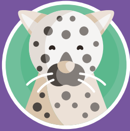
independent snow leopard